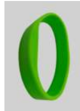
Silicone Wristband NXP MIFARE®