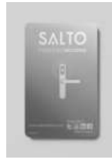
Key Card NXP MIFARE® HID®