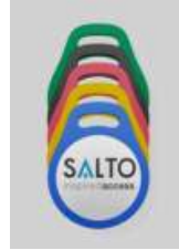
Key Fob NXP MIFARE®